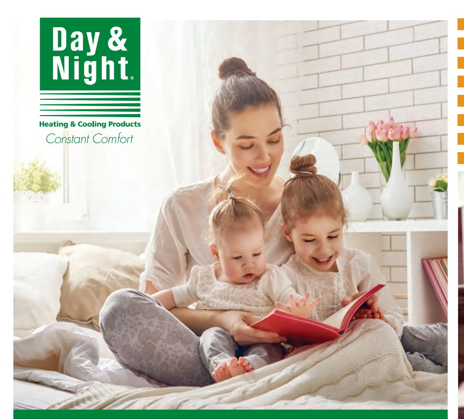
Day & Night<sup>®</sup> Ion<sup>™</sup> System Control with Wi-Fi<sup>®</sup> and Zoning<sup>1</sup> Capabilities